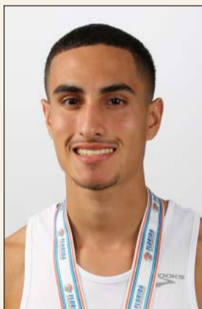
NICK DIAZ Sunset